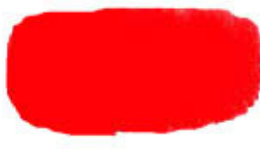
RD 63599 Naphthol Red BWS 6 / PR 112