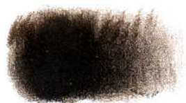
BRC 32284 Sepia BWS 7-8 / PBr 7