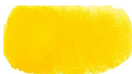
YLC 91780 Diarylide Yellow BWS 6-7 / PY 13