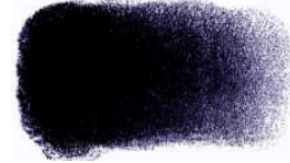
BKC 1945 Blue Black BWS 8 / PBk 7 PB 15:3