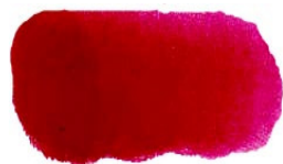
RD 63602 Rubine Red BWS 6 / PR 57:1

Safe Wash Oil Modifier - If you need to thin your ink, add a little Caligo Safe Wash Oil (WTC 83948)