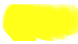
YLC 91779 Arylide Yellow * Process Shade BWS 6-7 / PY 3