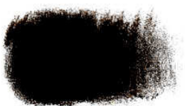
BKC 1944 Brown Black BWS 8 / PBk 7 PBr 7