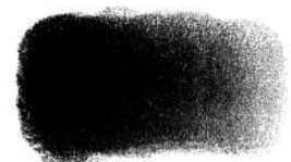
BKC 1943 Black BWS 8 / PBk 7