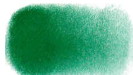
GRC 43171 Phthalo Green BWS 7 / PG 7