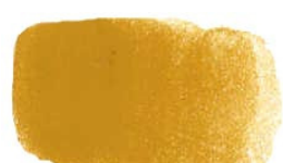
YLC 91782 Yellow Ochre BWS 7-8 / PY 42