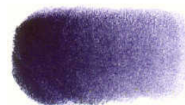
VLC 71204 Carbazole Violet BWS 7 / PV 23