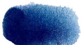
BLC 24915 Prussian Blue BWS 7 / PB 27